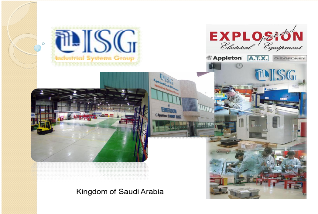
Kingdom of Saudi Arabia